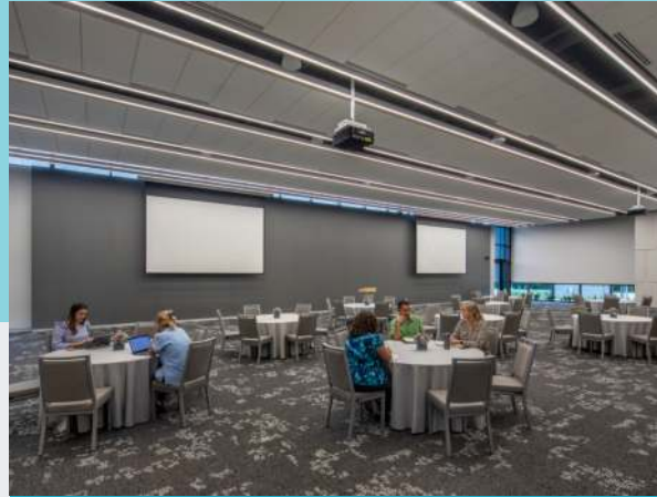
Large Conference Space